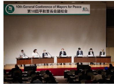
10th General Conference (October 2022, Hiroshima)

Mayors for Peace holds a General Conference once every four years in principle. Hosted alternately between Hiroshima and Nagasaki, the General Conference is an opportunity for member cities to decide and adopt agenda items significant to the organization.