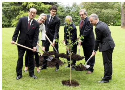
Planting ceremony of a second generation atomic-bombed Ginkgo seedling by a member city (April 2018, Guernika-Lumo)